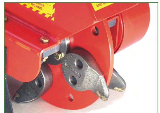
Tungsten carbide teeth

The information in this brochure is indicative only. The models described are subject to change without notice. The engine horsepower information is provided by the engine manufacturer to be used for comparison purposes only.