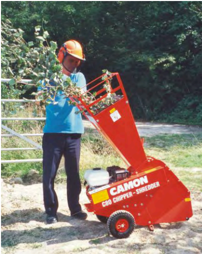
Independent shredding chute

These units also have an independent shredder feed which converts hedge cuttings, green waste etc into mulch quickly, effectively and without blocking. The side chute locks in an upright position for easy transportation and manoeuvrability.