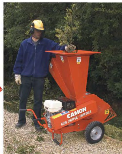
Lever to adjust size of finished product